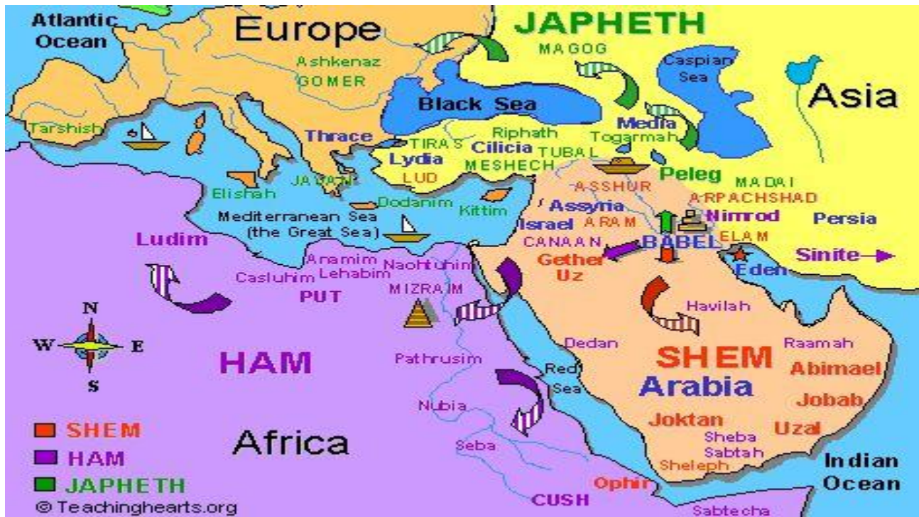
The Ancient Near East, 1800 to 1400 B.C.