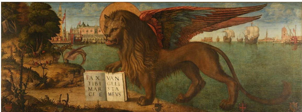
Mark the Evangelist's symbol is the winged lion