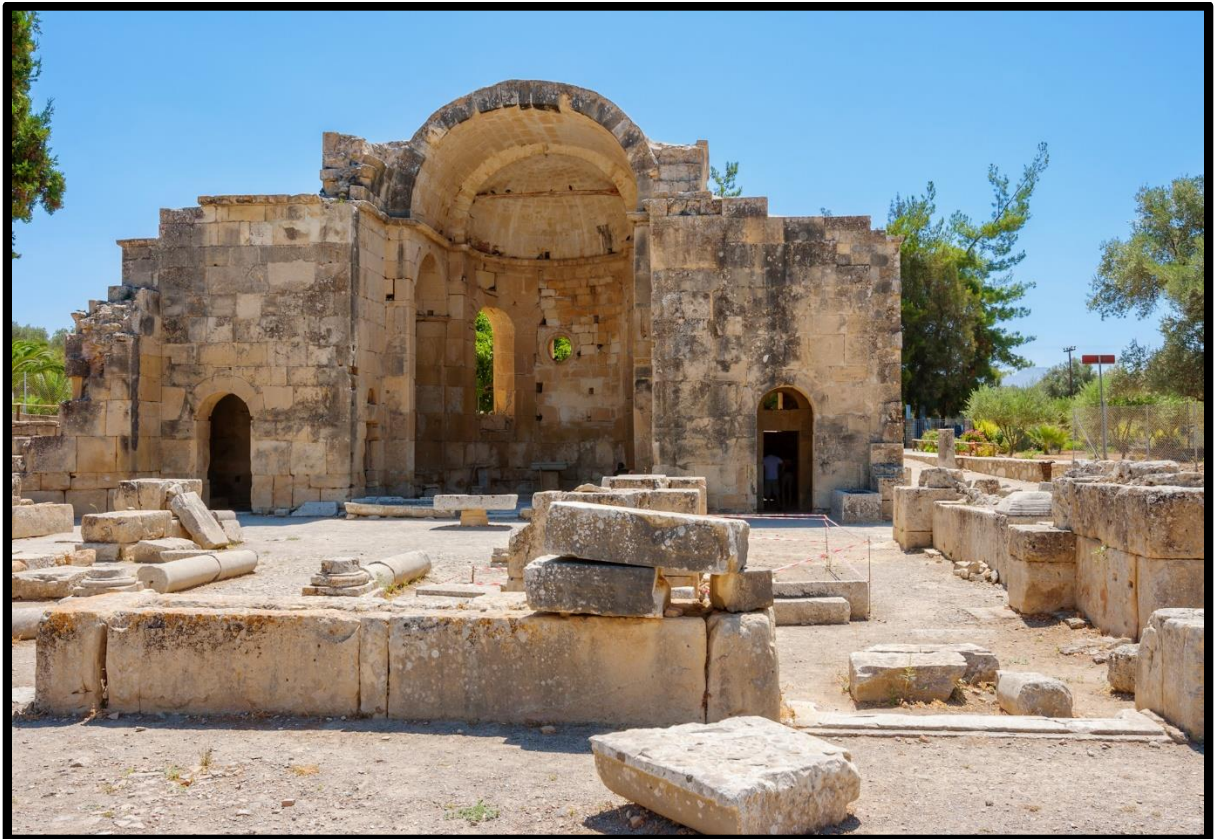
Saint Titus Basilica, Gortyna Greece