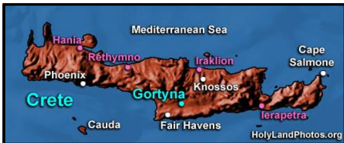
Titus – Gortyna, Crete Greece