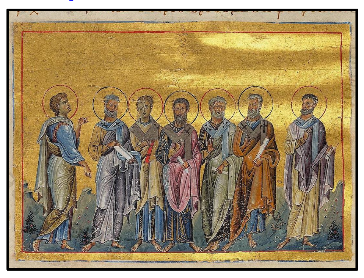
Sosthenes, Apollo, Cephas, Tychicus, Epaphroditus, Cæsar and Onesiphorus from the Menologion of Basil II