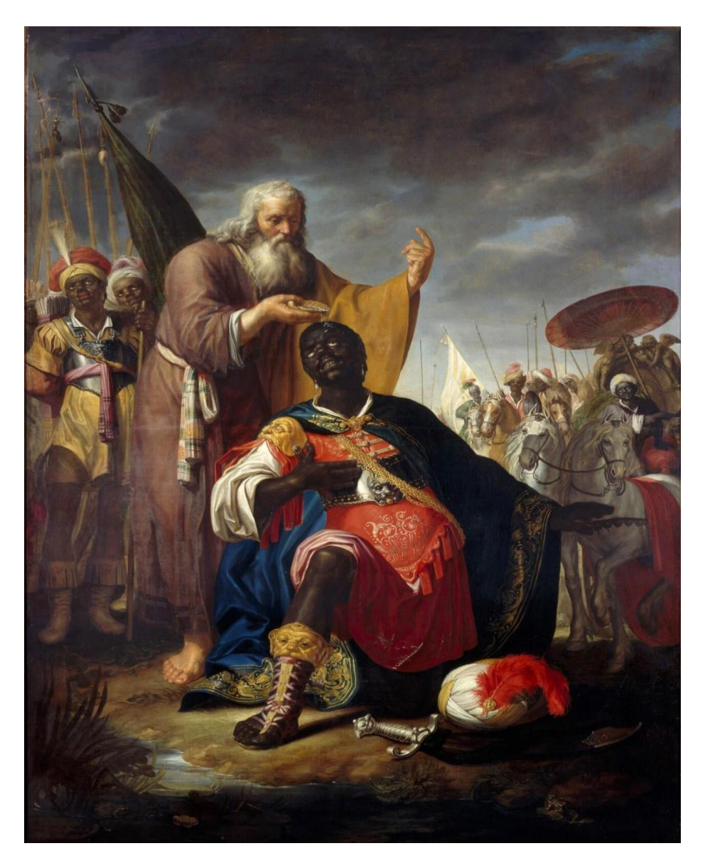
Philip Baptizes the Ethiopian Eunuch by Abraham Bloemaert