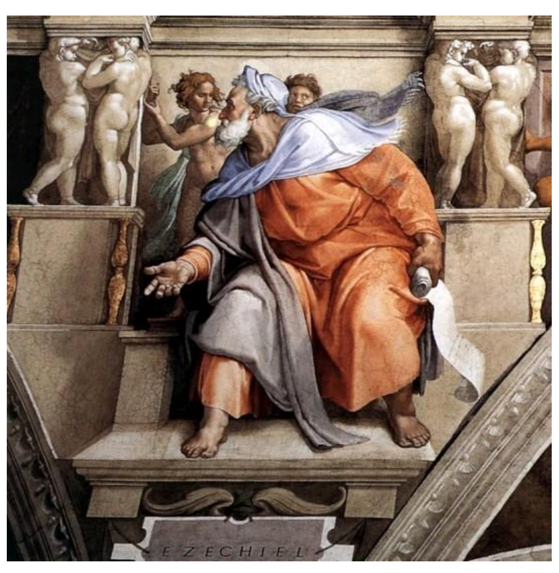
The Prophet Ezekiel by Michelangelo