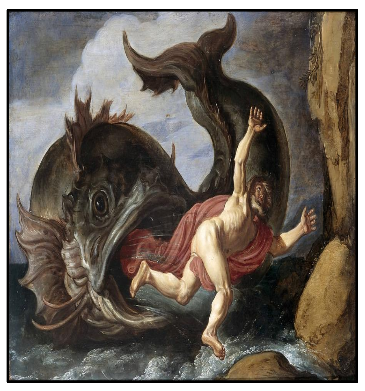
Jonah and the Whale by Pieter Lastman