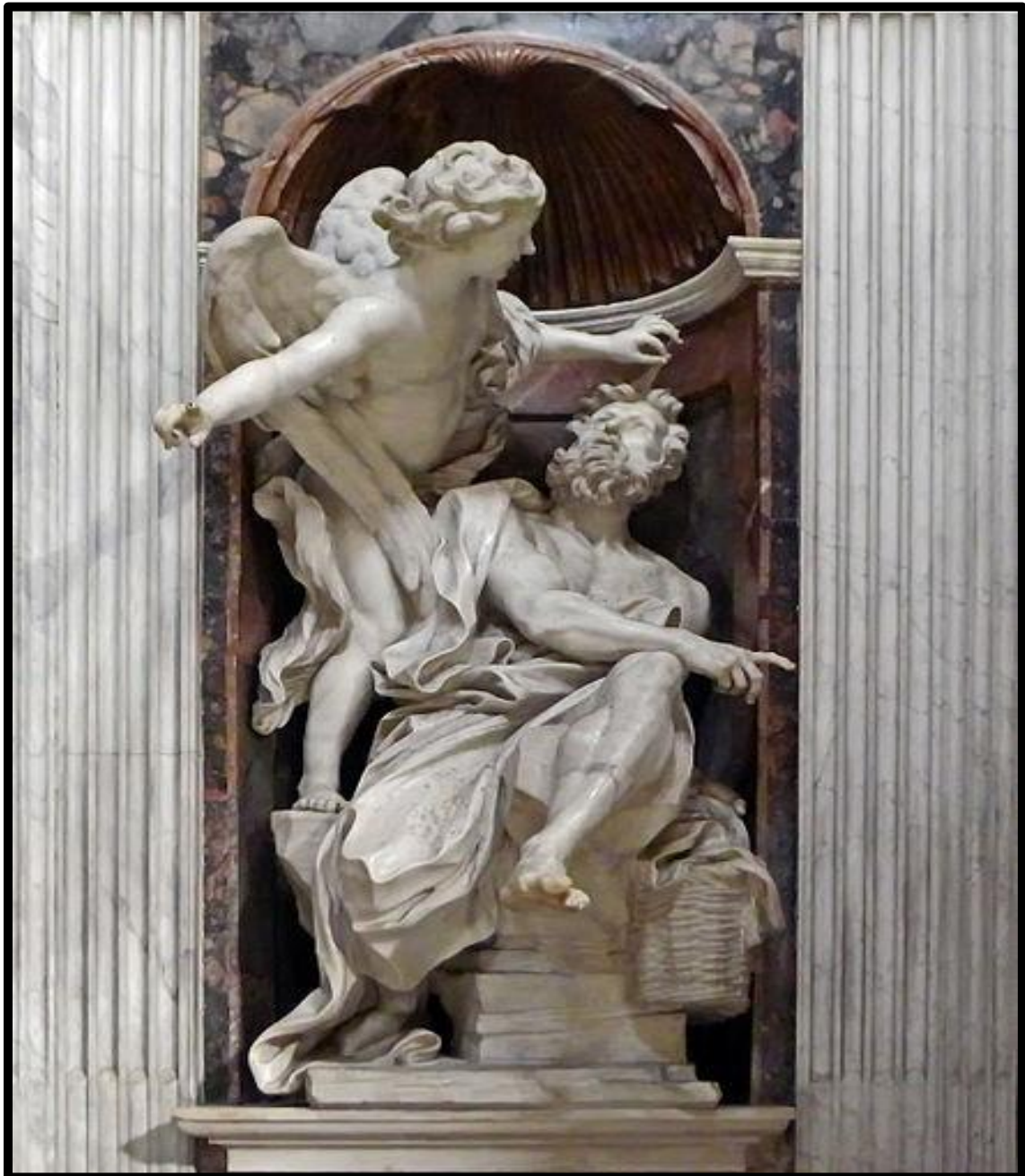
Habakkuk and the Angel by Bernini