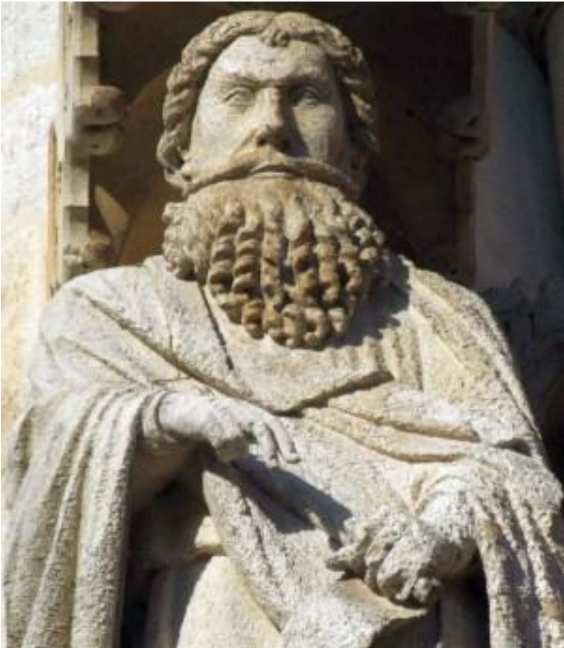
The Prophet Nahum, Amiens Cathedral