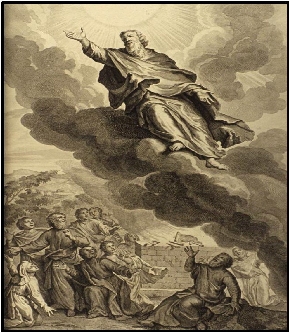
Enoch Walked with God by Gerard Hoet