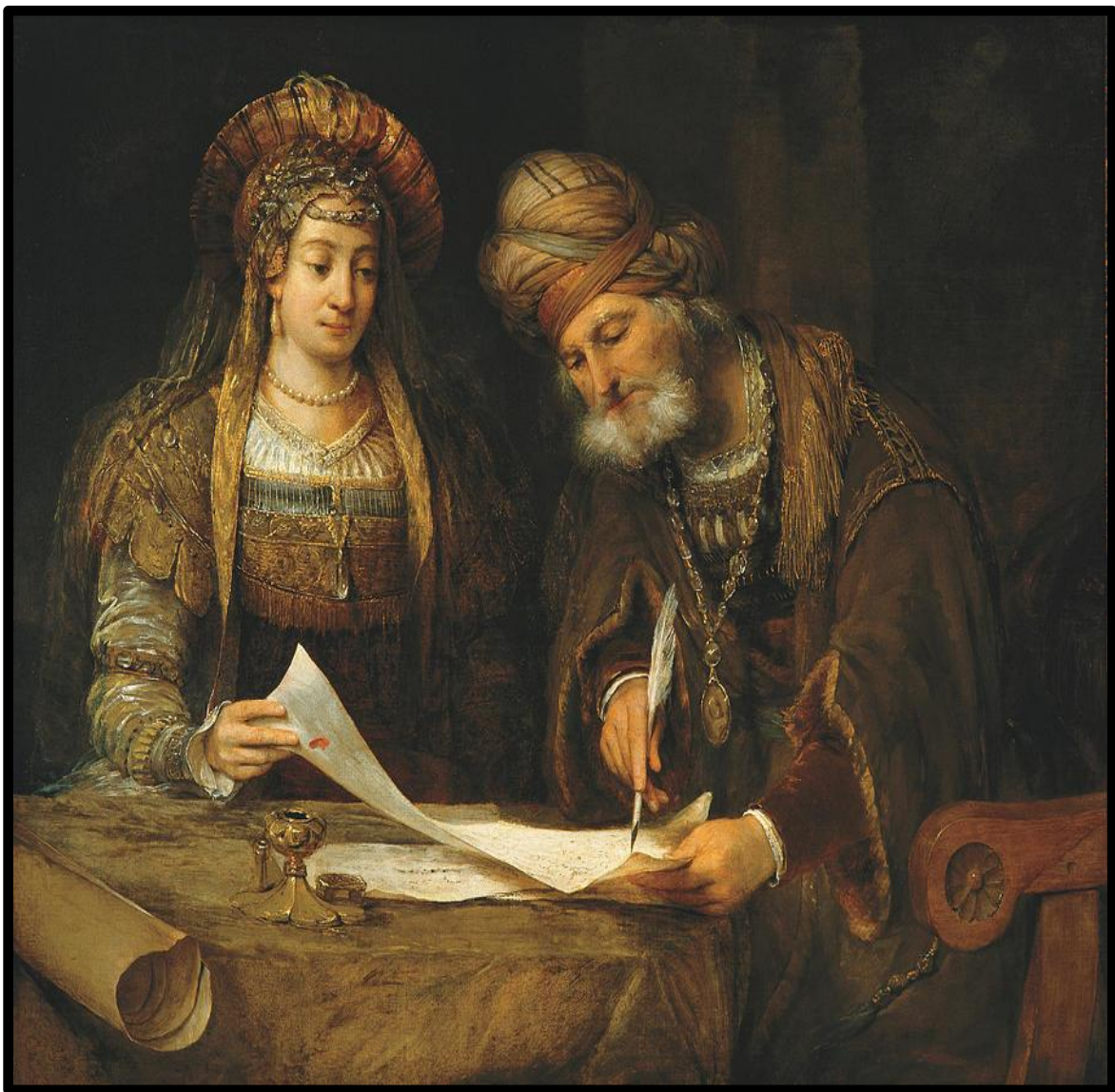
Esther and Mordecai by Aert de Gelder