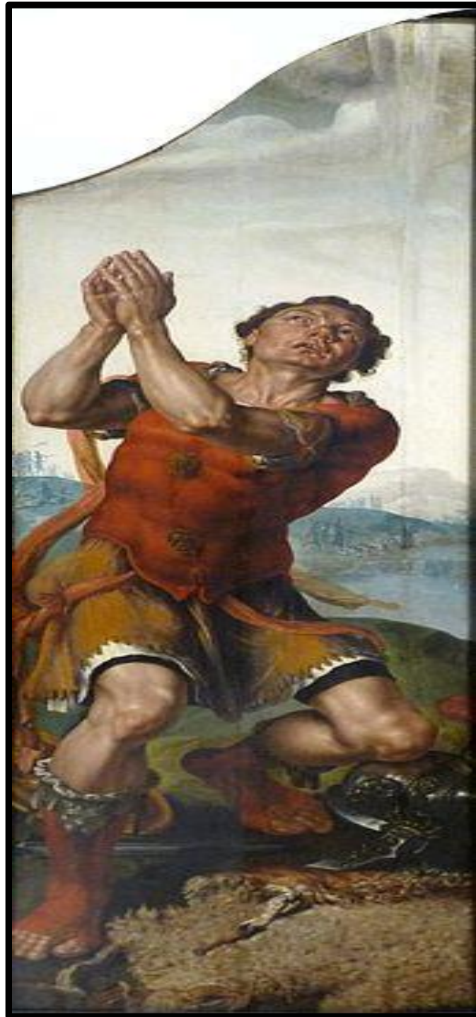
Gideon thanks God for the Miracle of the Dew by Maarten van Heemskerck