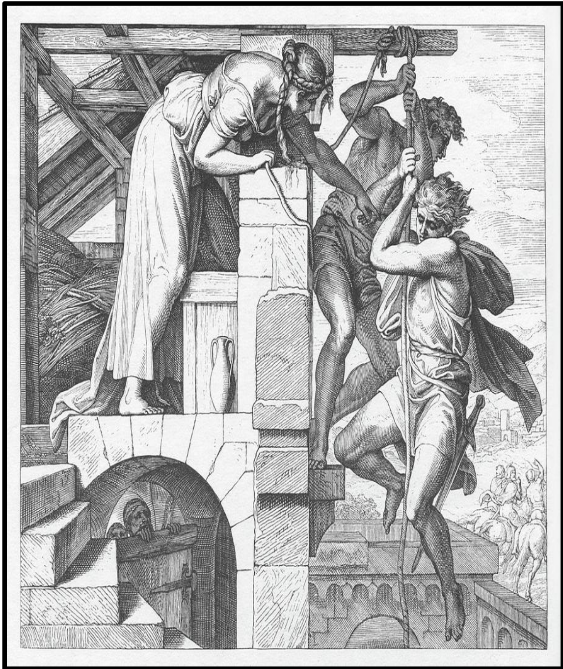
The prostitute Rahab assisting Israelite spies of Johsua by Julius Schnoor von Carolsfeld