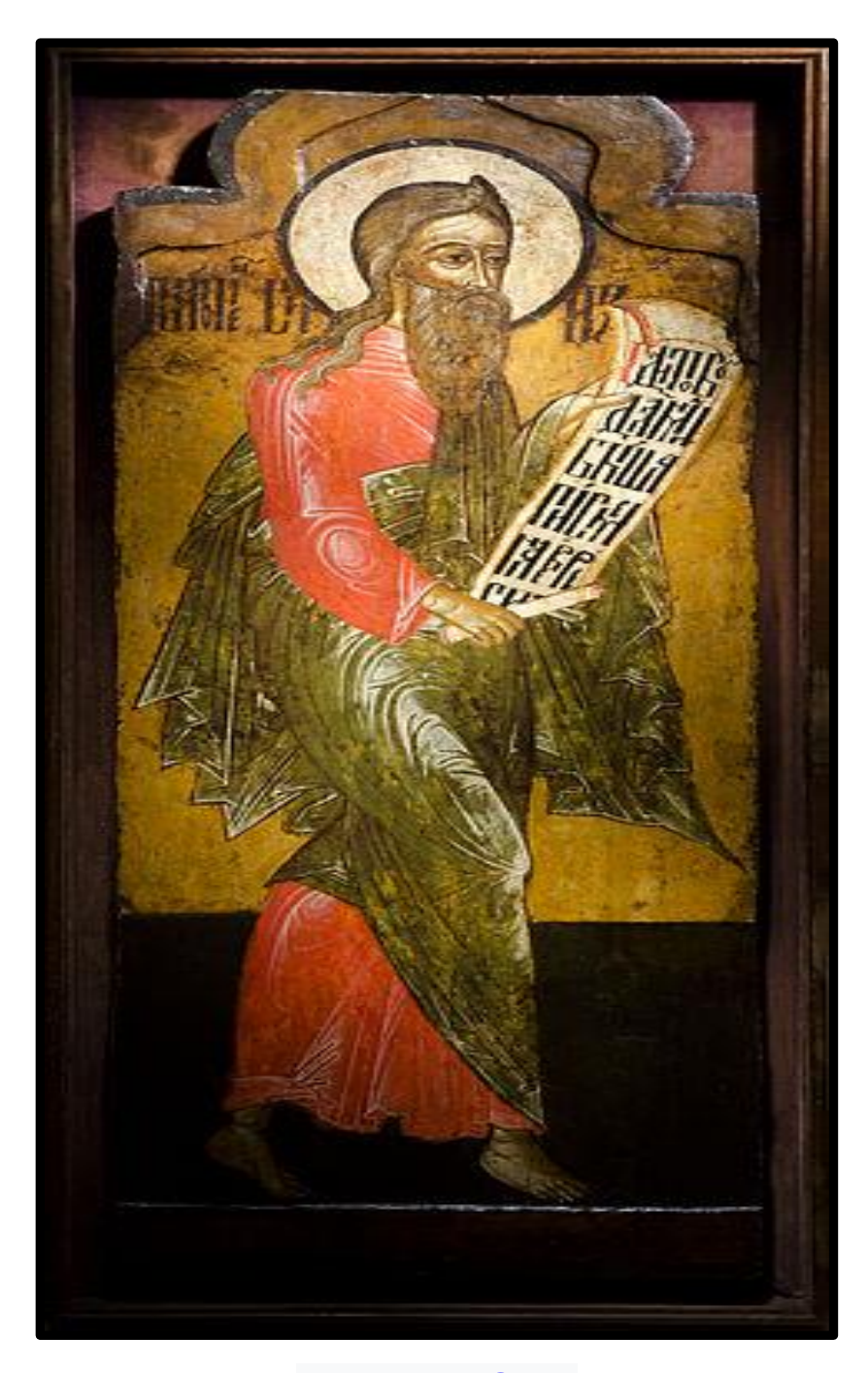
Patriarch Seth Egg tempera on gesso on canvas on wood