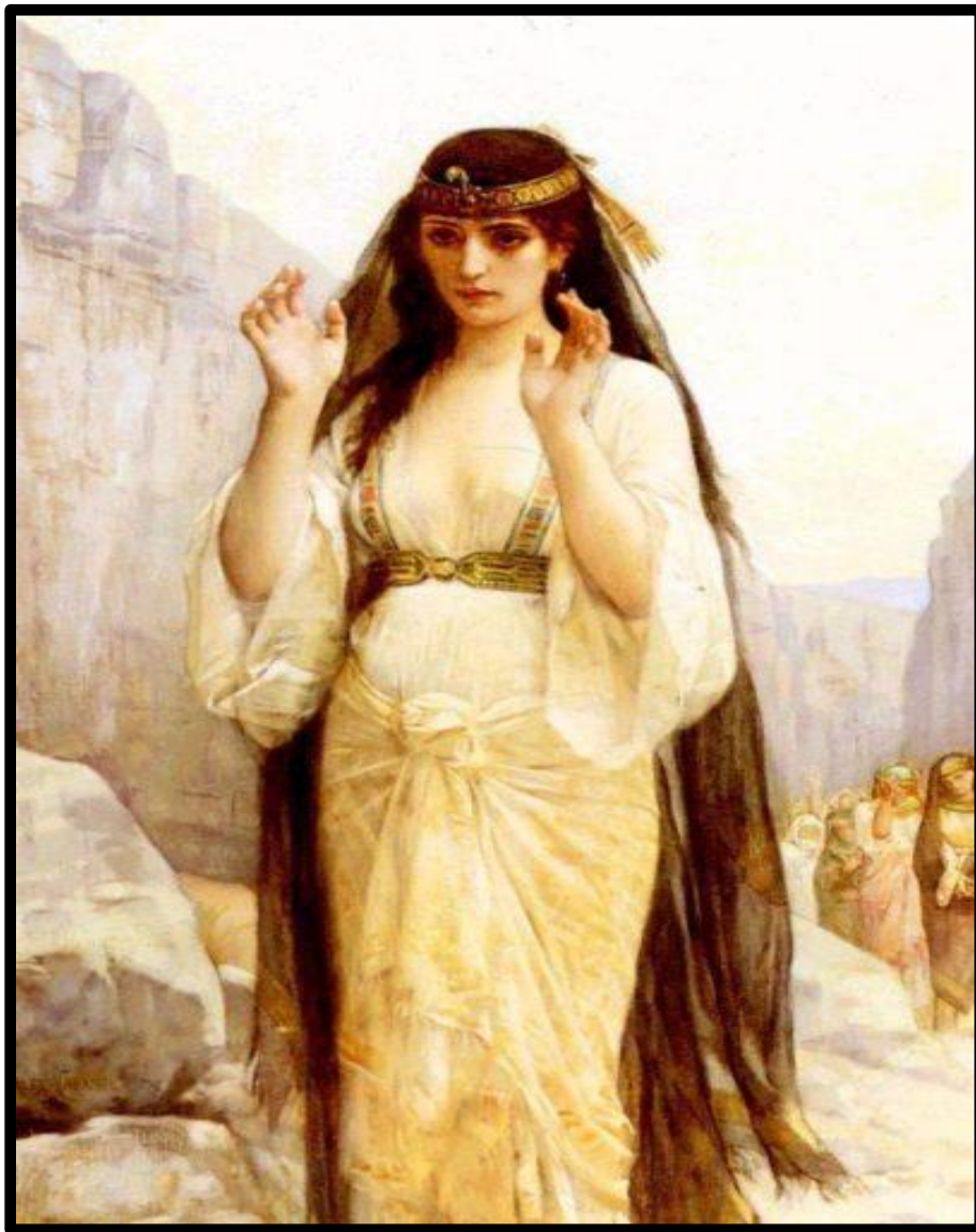
Deborah the Judge and Prophetess