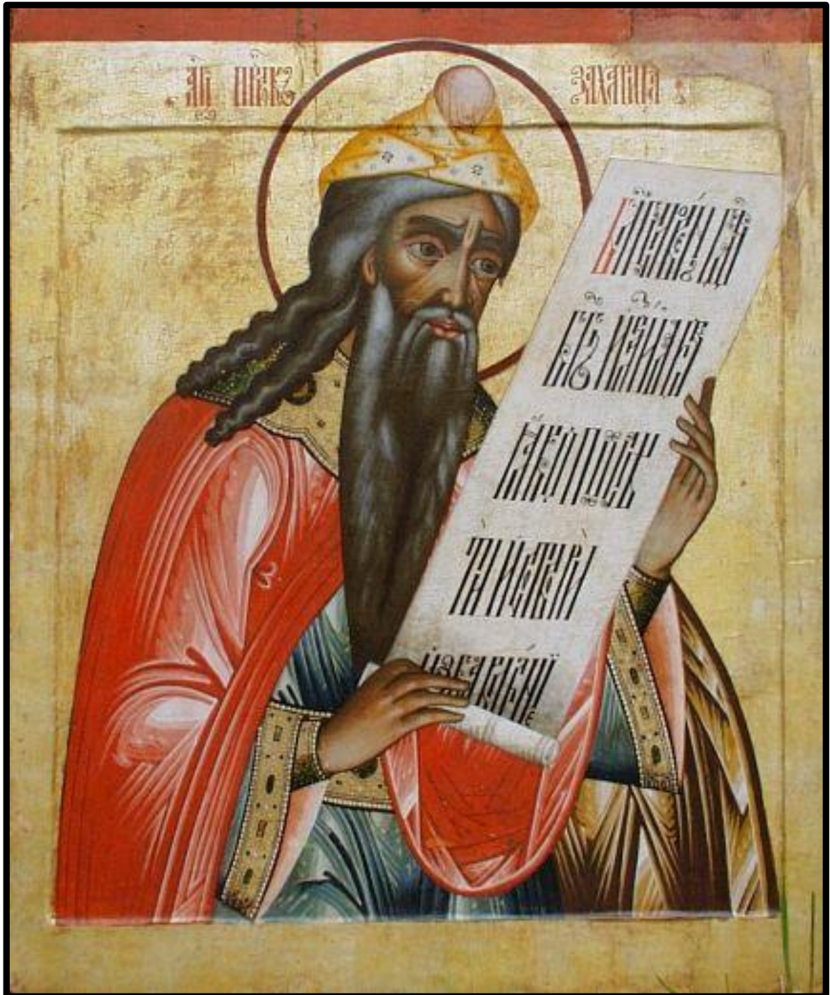
Prophet Zechariah at Kizhi monastery, Karelia, Russia